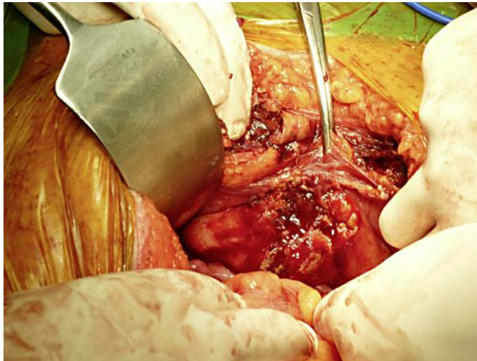
Fig. 2. Intraoperative photograph demonstrating colon perforation.